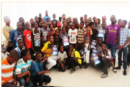
Cross-section of participants at the Ascend Boys Leadership Conference 2017