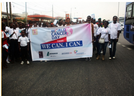
Cancer awareness and sensitization walk in Lagos Mainland