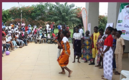
Dance presentation by Ovie Brume Dance Group