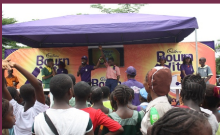
Pupils participating in the "60 Seconds Challenge" game facilitated by Cadbury Nigeria Plc