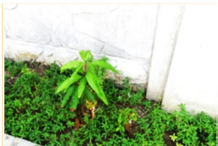
Mango ( Magifera indica ) seed growth after two month of planting.