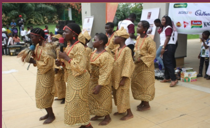
Cultural Dance presentation by Mainland Primary School Pupils