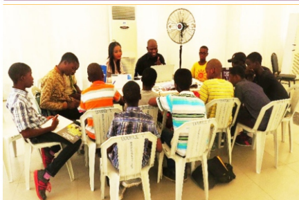
Participants at the FCM Travel Solution workshop seminar