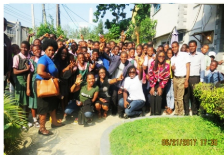
Cross section of participants and facilitators