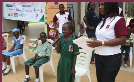
Contestants during the Spelling Bee Competition