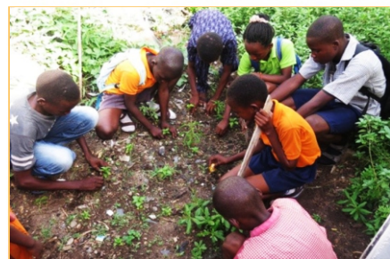
Participants planting Mango seeds ( Magifera indica ).