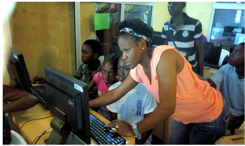
The facilitator training the participant on how to save their work on the computer

At the second session, the students received 15-page storybooks with letters in 10 font. The students were instructed to convert to soft copy by typing the book within a time duration of 1hour. Only 40% of the student completed this task within the stipulated period while 48% completed the task in 1 hour and 30 minutes.