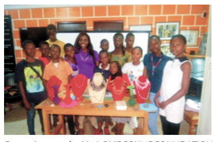
Summer Camp at Lagos Headquarter