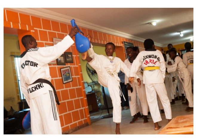
Picture captured during the Taekwondo training session at the Foundation