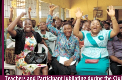
Teachers and Participant jubilating during the Quiz session of the Mr. Chef Grassroot Cooking Competition