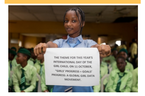
Picture taken at the International Day of the Girl Child at AUD. Comprehensive High School, Lafenwa with Over 320 female students present