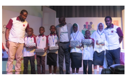
Picture of Contestant at the Grand Finale 3rd Lafarge Africa National Literacy Competition