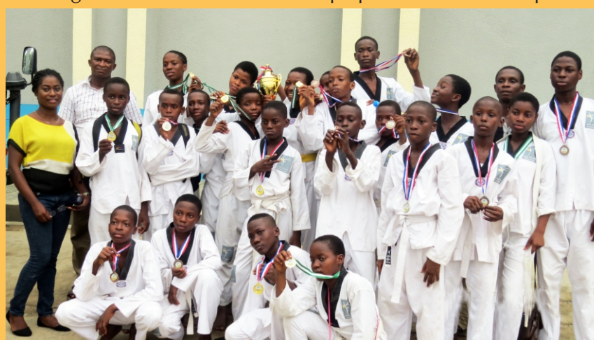
Cross section of overall winners of the 5th Kenny Martial Art Competition