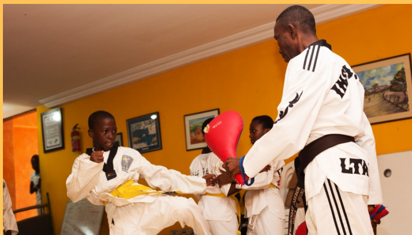
Training Session at the foundation in preparation for the competition

At the end of the competition the Ovie Brume Foundation emerged as the overall winner with 8 Gold, 8 Silver and 7 Bronzes Medals. 18 members of the team were also invited to display their skills at the commissioning of FITNESS KONNECTIONS, a new GYM in Ogun State.