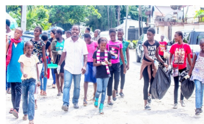
Ovie Brume Foundation members engaged in sanitation exercise during children's day