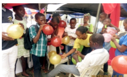
Youth Centre members decorating the Motherless Babies Home during the children's day party at Makoko