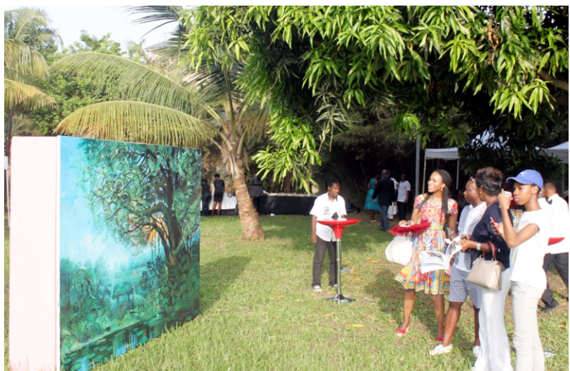
Cross section of pictures from the event