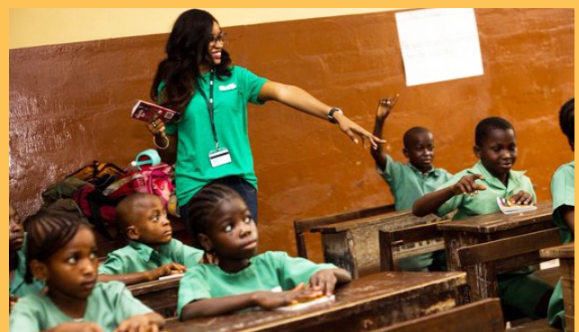
Cross section of pupils at Jinadu Anglican Primary School during the Book Club reading section