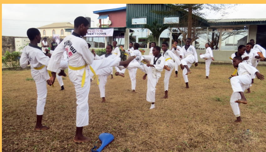
Taekwondo display at Fitness Konnections