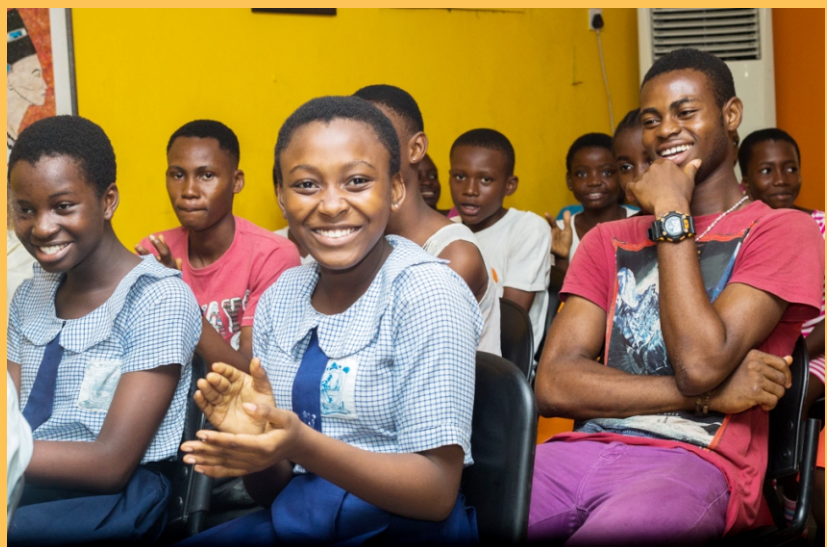
Cross section of Youth Centre members during the reading section